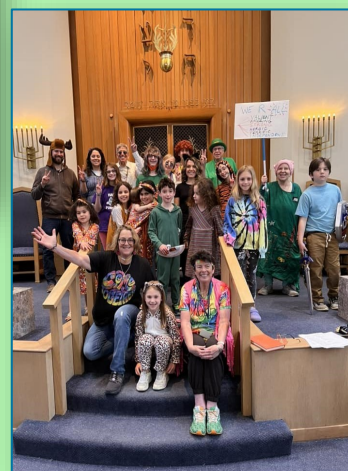
Purim Carnival Fun